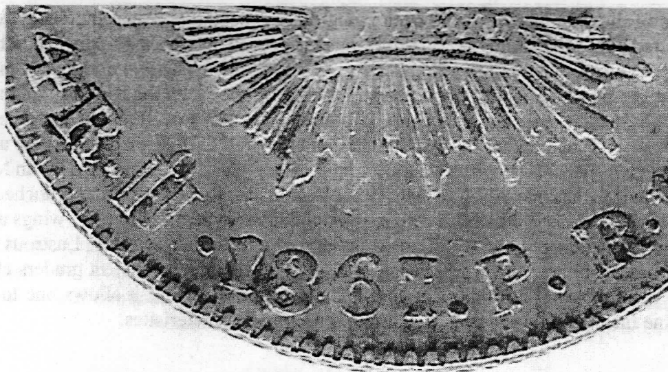
C. Close Up of MM, Date &amp; Assayer Initials

Compare the first digit of the date to the last digit. As I said above, it requires a good imagination to say that the 7 is over a 1. Another consideration is that we know that Hermosillo struck four reales in 1862, but none after that until 1867. That fact suggests that there would be an 1862/1 or an 1867/2 before there would be an 1867/1. Note also how much higher the 67 is than the 18. Compare to the 1861 which has a large 61 with the second 1 in the date entirely different from the first 1 in the date.