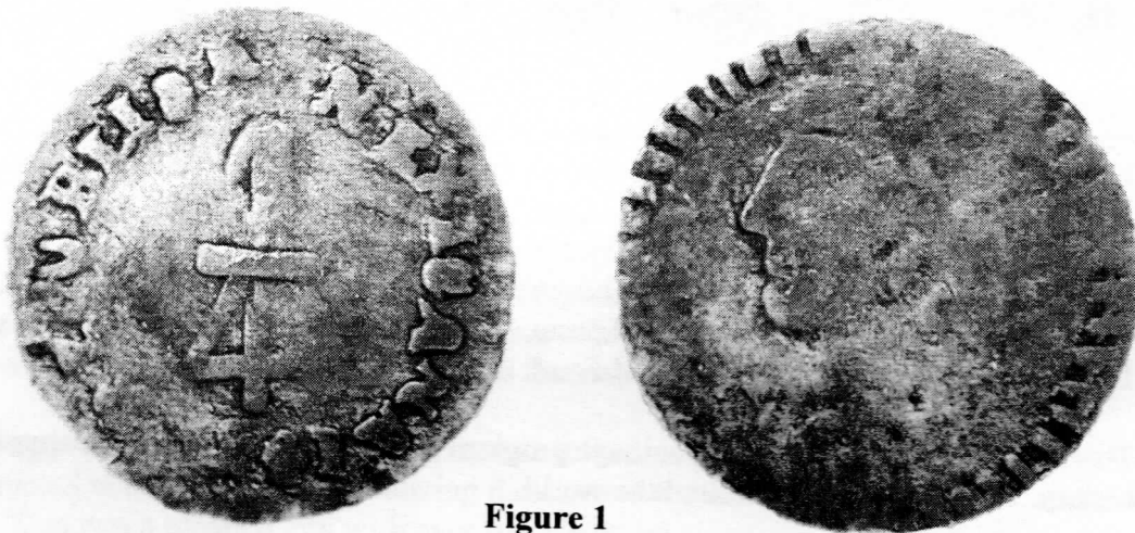
Figure 1 1841 Counterfeit Quarter Real

A Quarter Real from San Luis Potosi is presented for comparison (Figure 2). However, I must point out that San Luis Potosi used only the mintmark on the Quarter Real coinage issued. The other issuing mints showed a mintmark in front of Liberty's head and the initials behind the head.